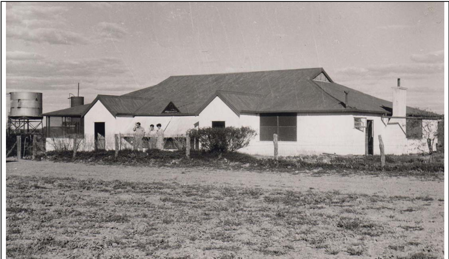
Australian Inland Mission hospital, Birdsville 1949