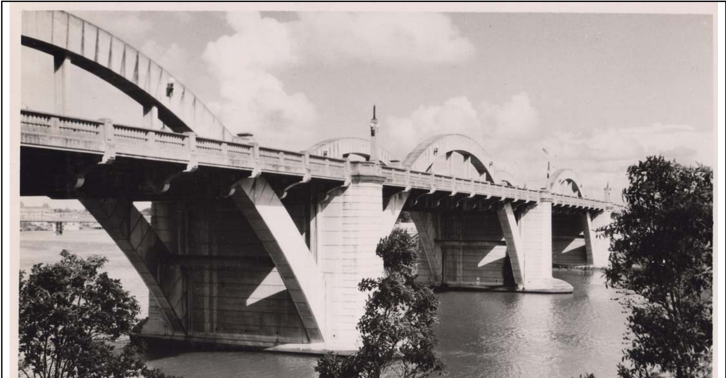
The William Jolly or Grey Street Bridge see story page 5