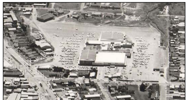
Chermside Shopping Centre pre 1972

According to the Brisbane history group's publication Brisbane timeline: from Captain Cook to CityCat p321, Australia's first drive-in shopping centre was built for Allan & Stark (now Myers) at Chermside and was opened on 31 May 1957. The image below shows an earlier stage of development but still with the name “Myer” on the façade.