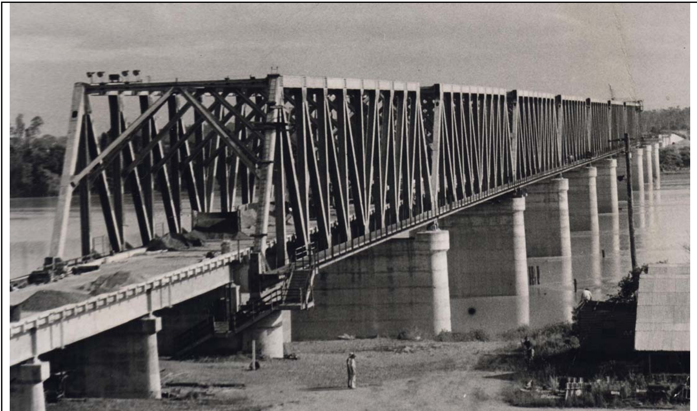
Burdekin Bridge circa 1957 see story page 7