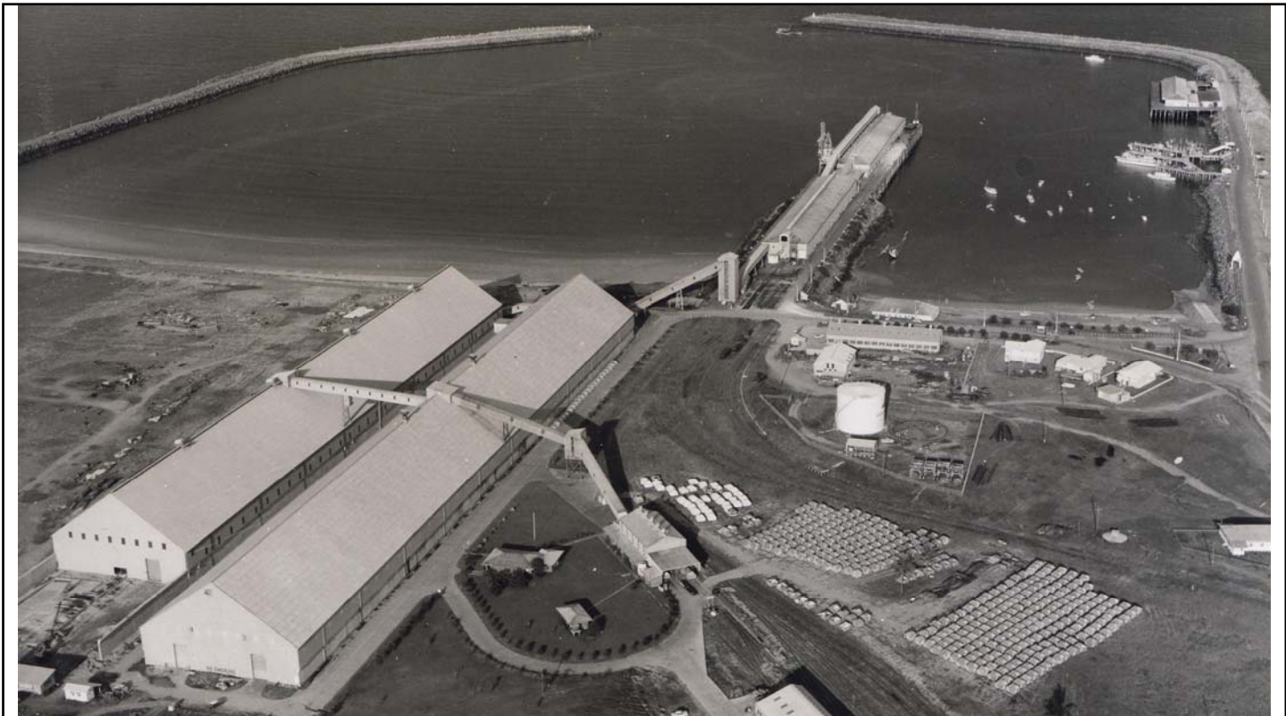
Mackay Bulk Sugar Terminal