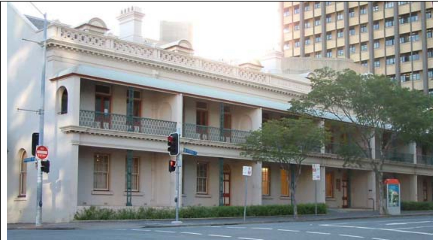
Harris Terrace, George Street Brisbane first occupied in 1867