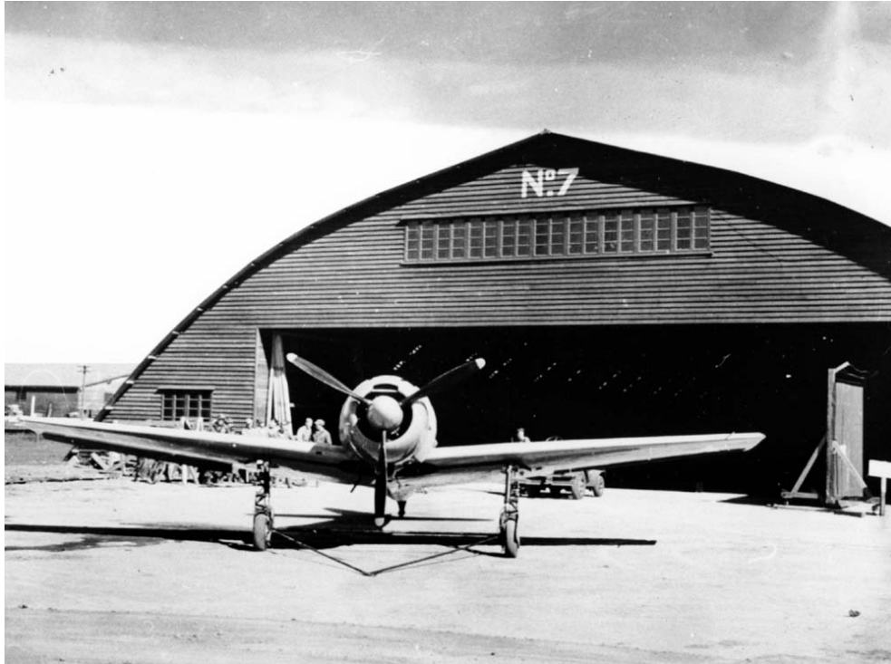
The Eagle Farm Hangar 7 in 1943 with the rebuilt Mitsubishi Hamp ready for a test flight

The EAGLE FARM AVIATION SOCIETY Inc. has been created to establish a community owned aviation museum nucleus of the Eagle Farm Community Heritage Centre in this heritage-listed hangar on the site of the WWII airport. An area that encompasses the hangar, the Engine Test Stands and the Women Convicts' Prison has been set aside by the Brisbane City Council as a Heritage Precinct.