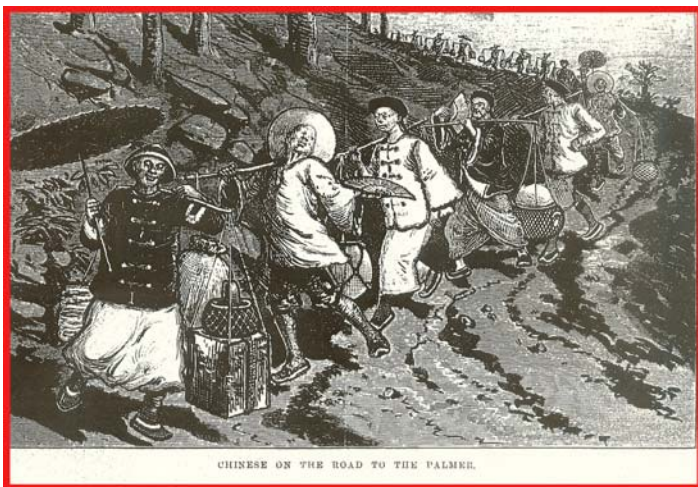
CHINESE ON THE ROAD TO THE PALMER.