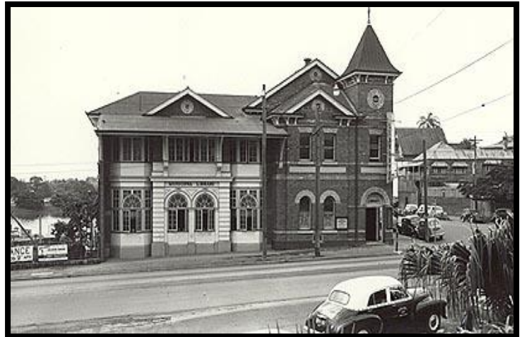
The old South Brisbane Library

In the previous RHSQ Bulletin , I wrote that funding had been applied for in order to make a short documentary film about the old South Brisbane Library, and asked people to tell me if they had had any particular connection with it. Several RHSQ members have contacted me.