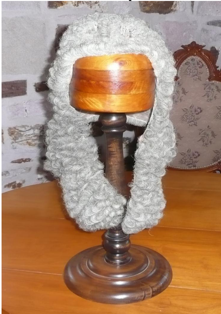
Sir Samuel Griffith's Wig RHSQ Collection 1457/99

Sir Samuel Griffith's Wig, which had been on loan for sometime, is now back at the museum and on display in the Early Queensland Exhibition . Griffith