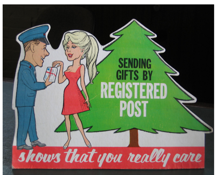
Poster from Post Office Exhibition RHSQ collection

Many people believe that the first office for the handling of letters that arrived in the Moreton Bay Penal Settlement was at the Commissariat Store. The Post Office Exhibition, features this story and the history of the GPO including time line, photos and text. Other topics covered are the story of the Electric Telegraph, the invention of the telephone, the Trans-Atlantic Cable and decimal currency. Objects on display will include postal scales, ink wells, sealing wax and post office signs. This exhibition is now well underway.