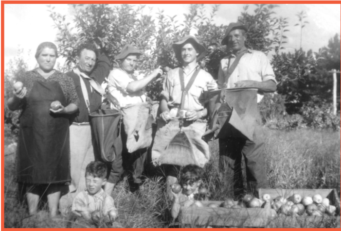
Photo: Italian family having a break from picking apples