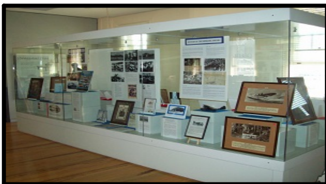
The Aviation Display on the top floor

SCENES FROM THE OPENING OF THE AVIATION EXHIBITION AT THE 'AT HOME' SATURDAY 23 NOVEMBER