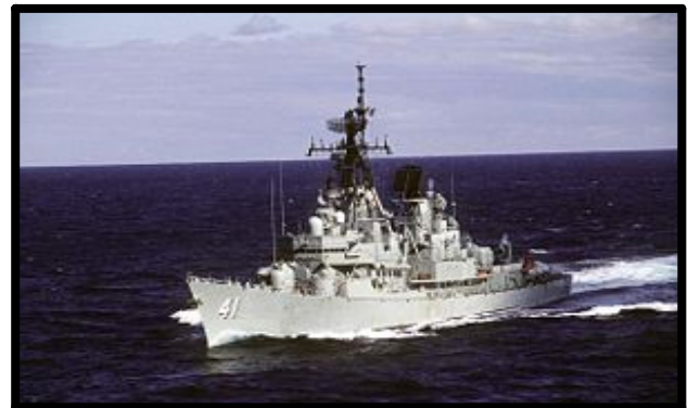
HMAS BRISBANE (DDGH41) A HOBART CLASS AIR WARFARE DESTROYER PREDICTED TO ENTER SERVICE IN 2017 (concept photo)