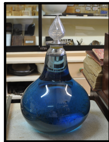
The 1836 Carboy

However, more treasures fill the dispensary at the rear. Volunteers will point out ancient prescription books and ledgers, brass pill presses, mortars and pestles, suppository moulds, hundreds of 1890s glass-stoppered bottles, many containing their original contents (think ‘skin of snake and eye of newt’) as well as an 1836 carboy.