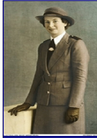
Captain Vivien Bullwinkel sole survivor of the Banka Island massacre