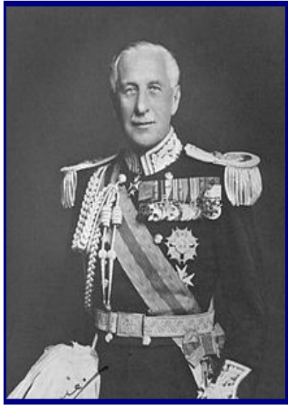
The Governor General, Lord Gowrie