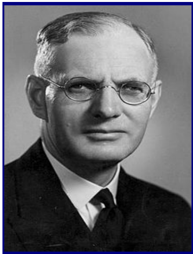
The Prime Minister, John Curtin