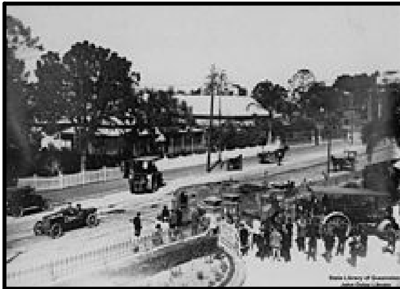
Mephisto and the two Council steam tractors moving from the docks to the museum