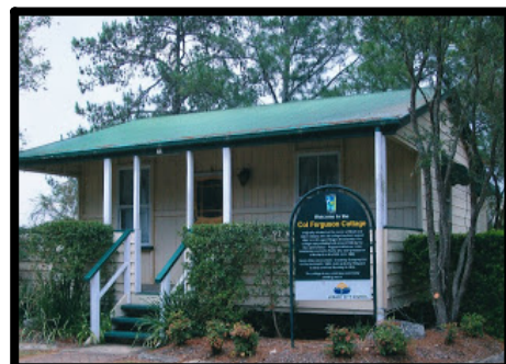
Logan Village Museum photo

The museum is situated in River Street, Logan Village and is part of the Logan Village Community Centre. Well worth a visit.