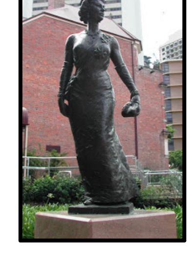
Statue of Queen Elizabeth II