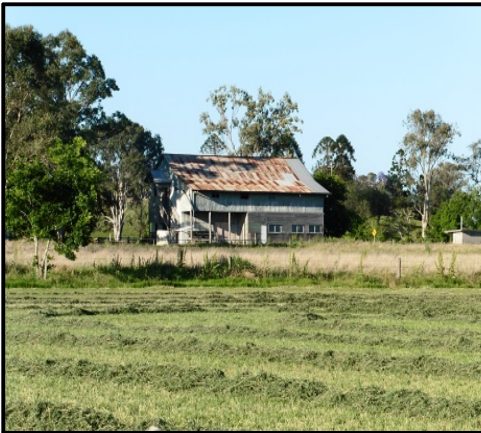
Warrill View Show and Pony Club Hall before planned demolition Photograph taken by Ruth Kerr on 25 October 2016

Warrill View on the Cunningham Highway – The Warrill View Show and Pony Club Hall will soon be demolished. It is 76 years old but is now unsafe because of infestation by white ants. The building is two storeys and is 23 X 13 metres. An estimated $10,000 worth of Oregon timber beams attracted a buyer. The building was opened on 1 May 1940. It is on a reserve administered by trustees. ( The Fassifern Guardian 19 October 2016 pp. 1 and 2 including three photographs)