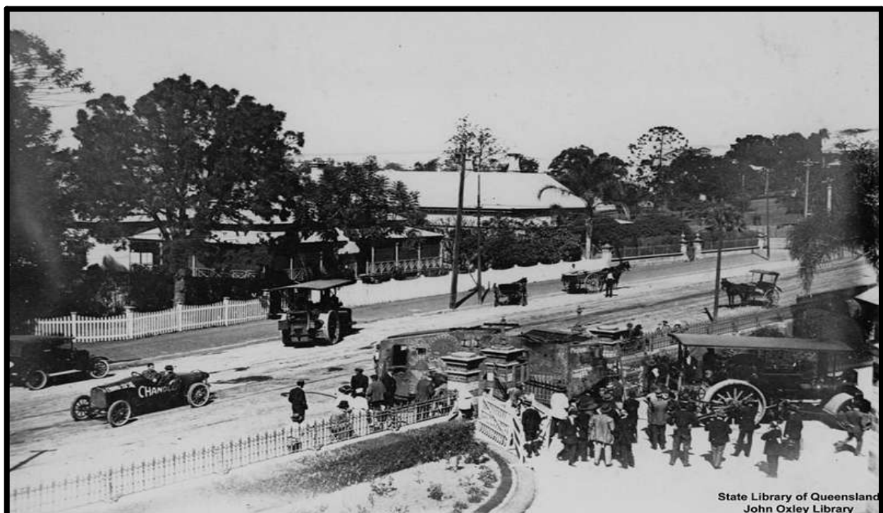
Moving Mephisto from the docks to the museum