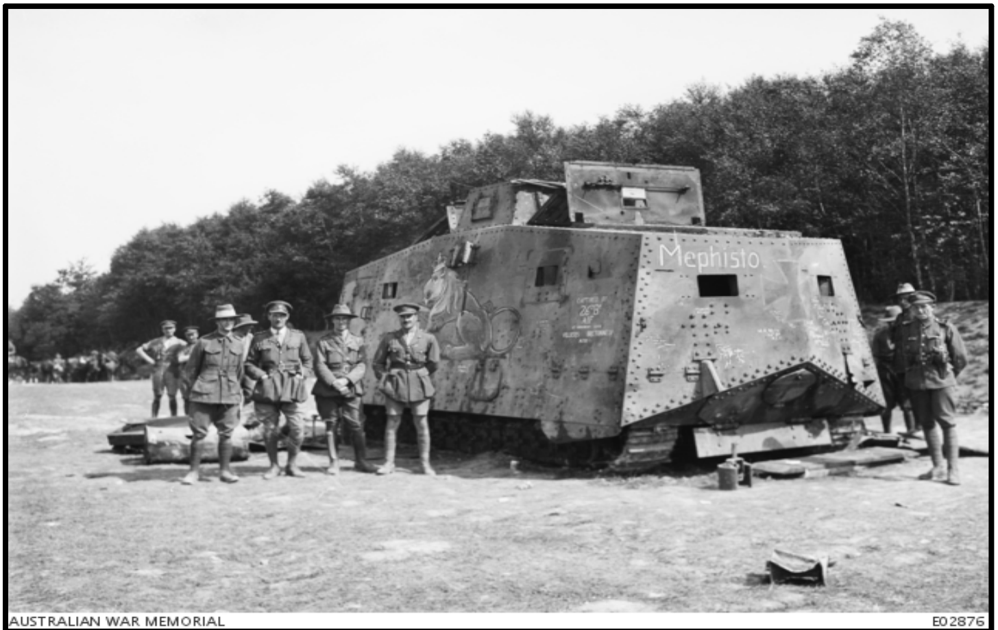
Mephisto shortly after its capture at Villers-Bretonneux in April 1918

work and is currently displayed in Canberra but is due to return again to Queensland for display. This presentation tells the story of Mephisto, including its development, operational history (as part of the first German tank unit which launched the first German tank operation), capture and post-war history in Australia.