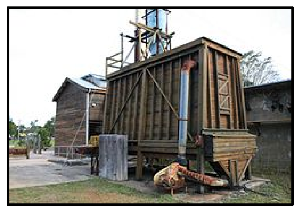
Cooroy Lower Mill Site Kiln 2009

Cooroy Lower Mill Site - Noosa Shire Council is undertaking repairs of the old boiler house and kiln at the Lower Mill Site in cooperation with the Department of Environment and Heritage Protection as the site was listed in 2008 under the Queensland Heritage Act 1992 . The Noosa Shire Council took over ownership of the Lower Mill Site in 2002 from the Queensland Government. The kiln was built in 1956 and was the first drying kiln built in the region. Cooran based Marbelle Pty Ltd is the primary contractor for the work which will take three months. ( Noosa Today 9 February 2017 p. 5 including photograph)