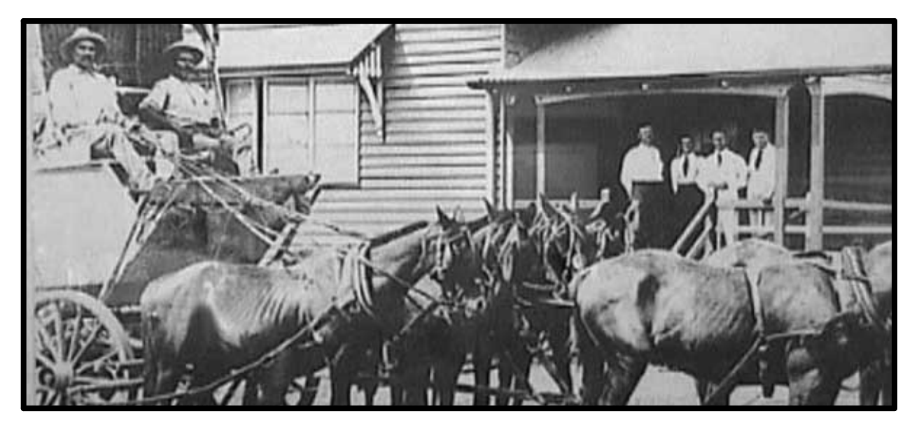
Royal Mail Hotel photo