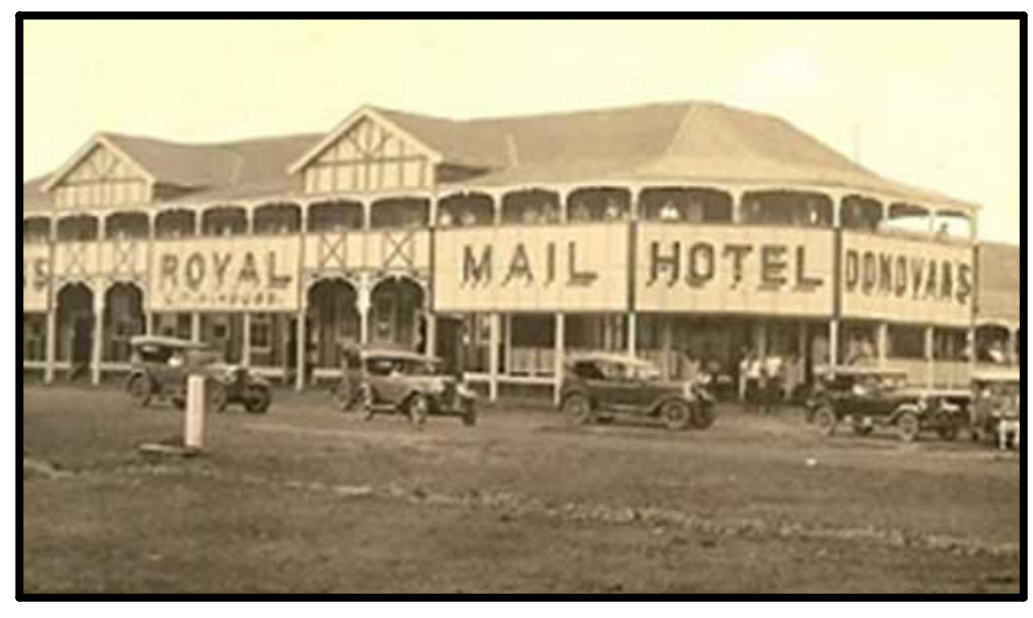
Royal Mail Hotel photo