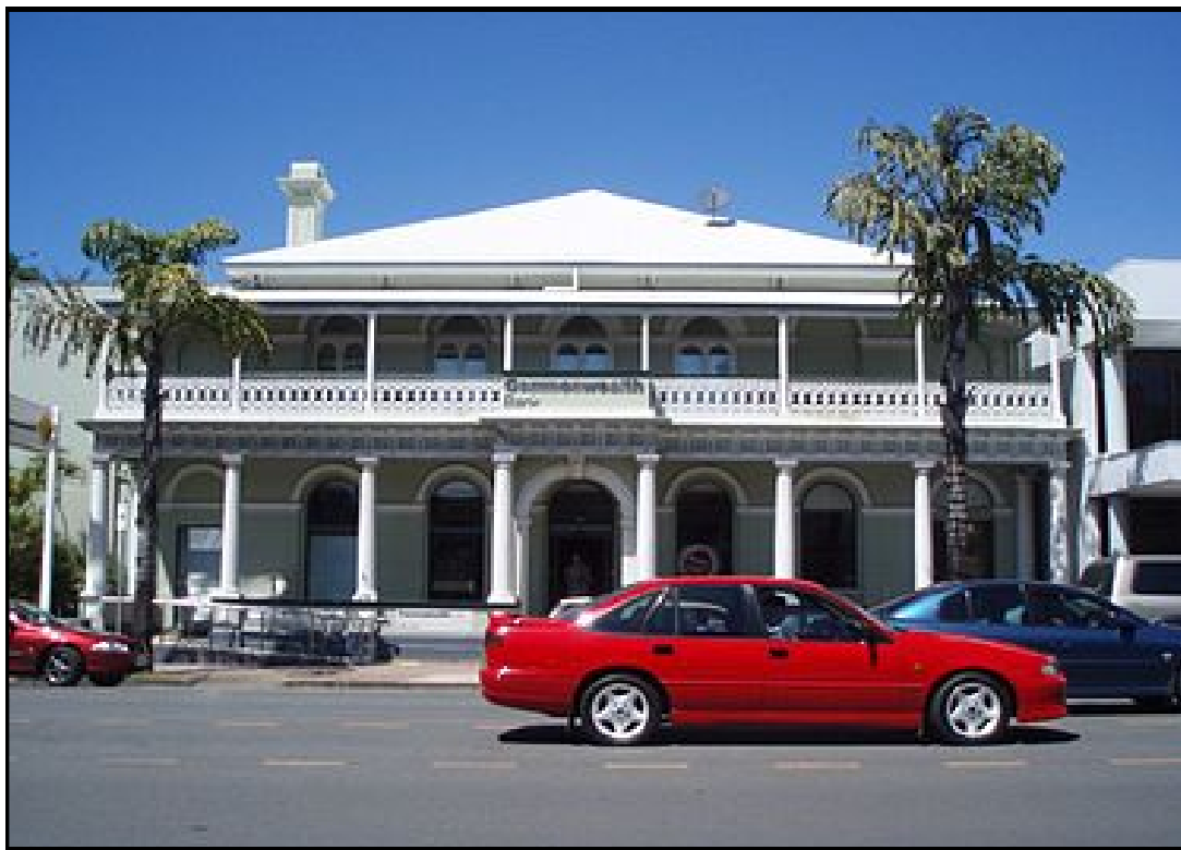
Old Heritage Photo