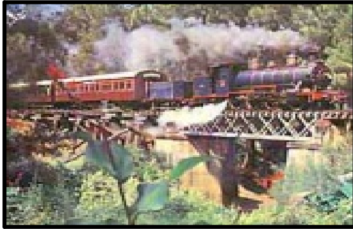
Ravenshoe Railway Photo