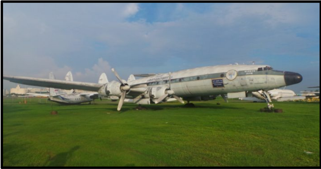
QANTAS Founder Museum Photo

November 1926. The museum's Q100 project will feature 100 past Qantas employees from 1920 to the present day telling their stories through interactive exhibits and displays. The museum's Boeing 707 and 747 will be repainted and they hope to build a replica Short Empire Class Flying Boat. ( Longreach Leader 13 July 2018 p. 7 including photograph and Rural Weekly 13 July 2018 p. 38 including four photographs)