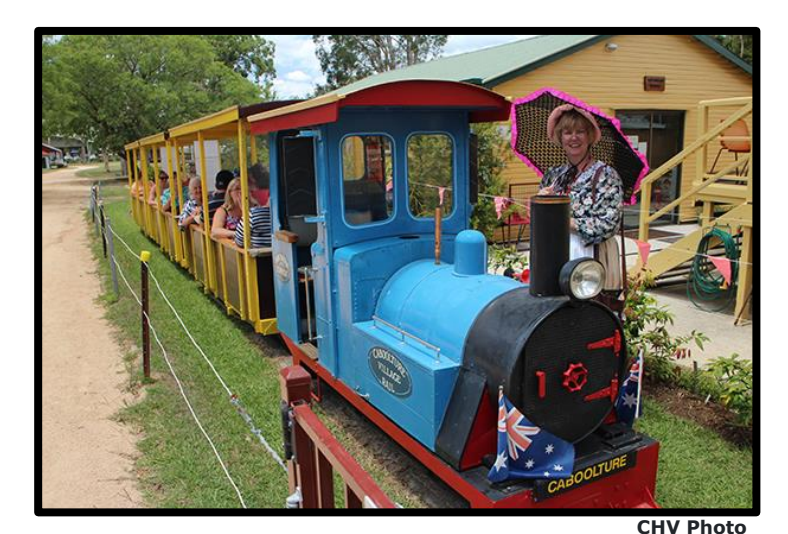
The Village Train