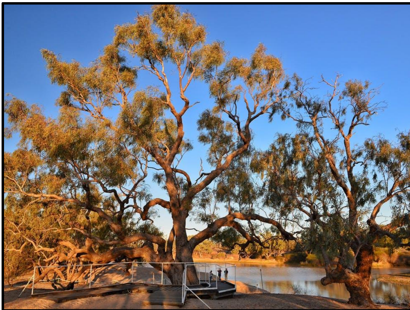
Thargomindah Visitor Centre Photo