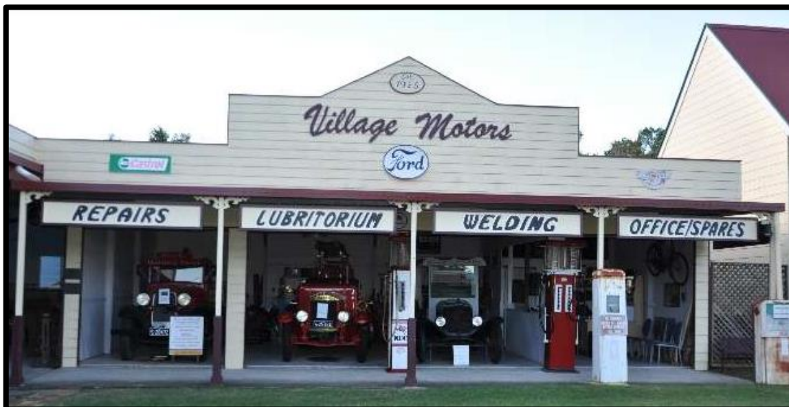
Hervey Bay Historical Village Photo