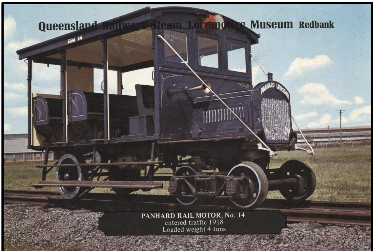
Old Railway Steam Locomotive Museum Photo