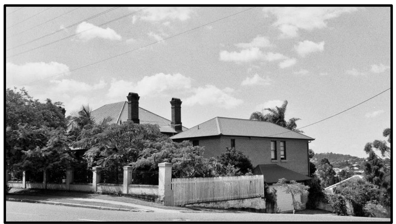
Oueensland Government Heritage Photo