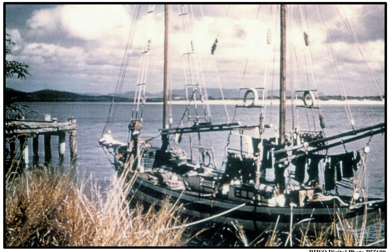
RHSQ Digital Photo P55600