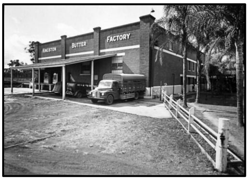
Queensland State Archives, Digital Image ID 23180