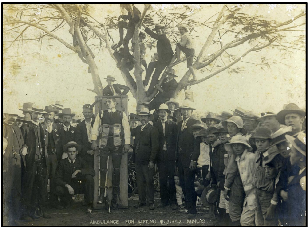
RHSO Digital Photo P55431

The above photo from the Society's photo collection, displaying only the caption "AMBULANCE FOR LIFTING INJURED MINERS" remains a mystery. Our researchers have not been able to uncover any further information, such as date, location and occasion, and whether this method was ever used in mining accidents. Perhaps one of our readers has some information?