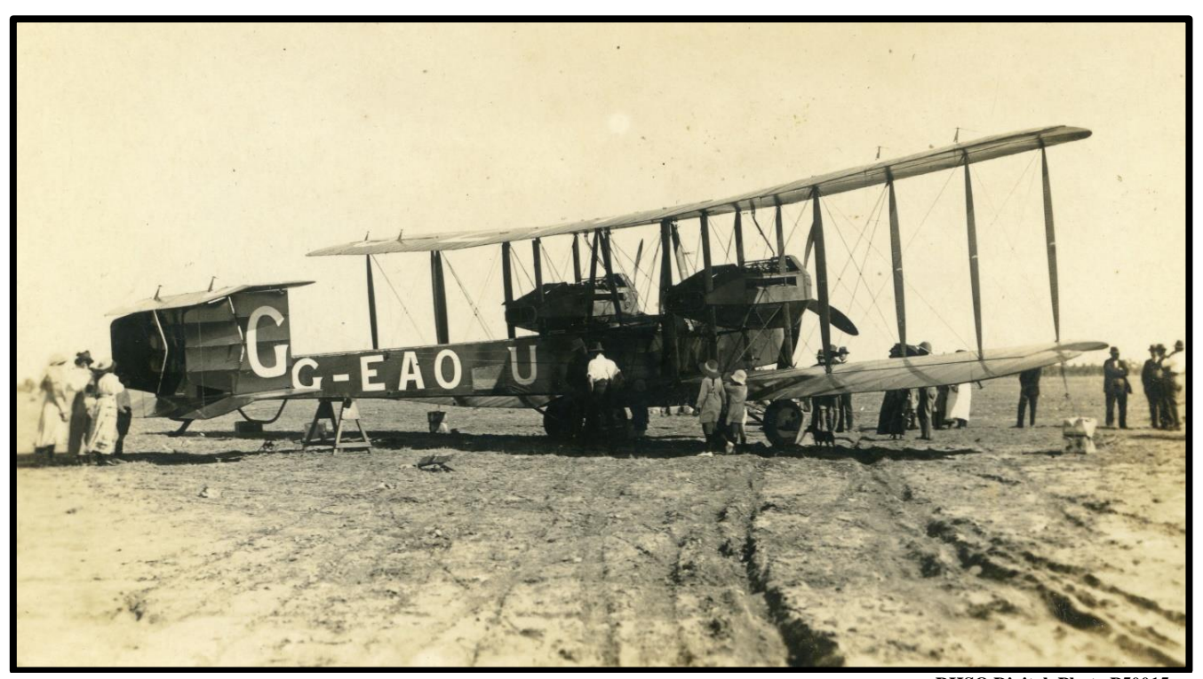
RHSQ Digital Photo P50015

Ross Smith's plane G-EA-O-U on the ground at Charleville airport, December 1919