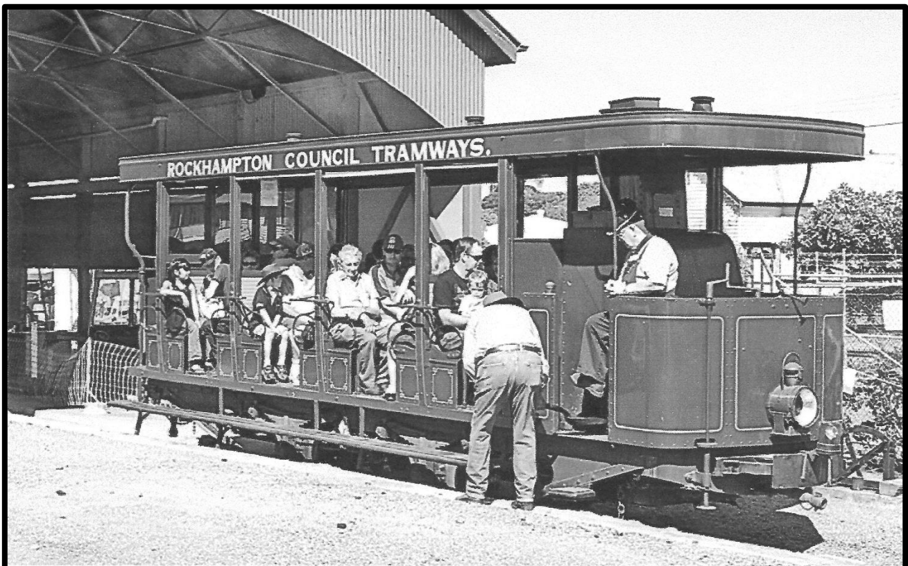
Tram passengers wait patiently while the Purrey steam tram is refuelled outside the Archer Park station on Sunday June 7 2009.