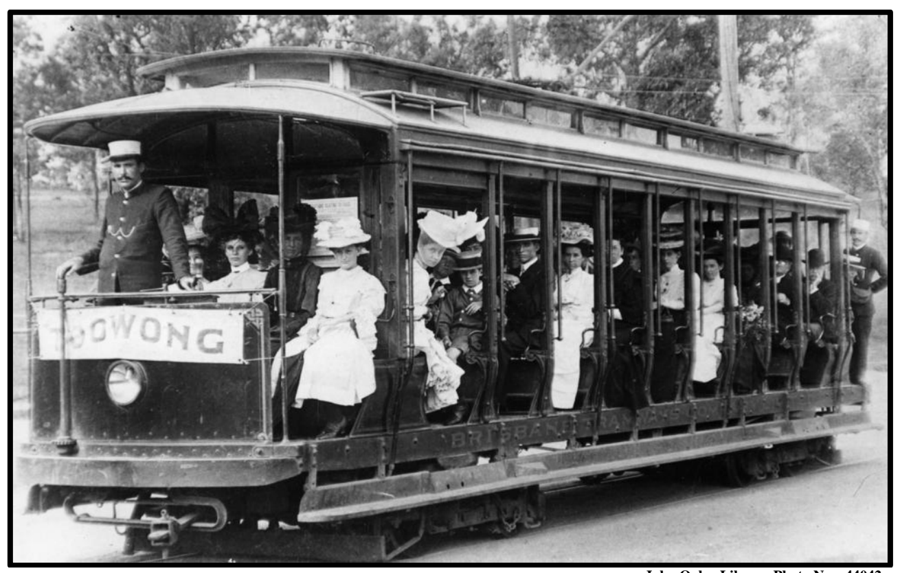
John Oxley Library Photo Neg. 44042

An open-sided tram loaded with people destined for the Toowong area, ca. 1905.