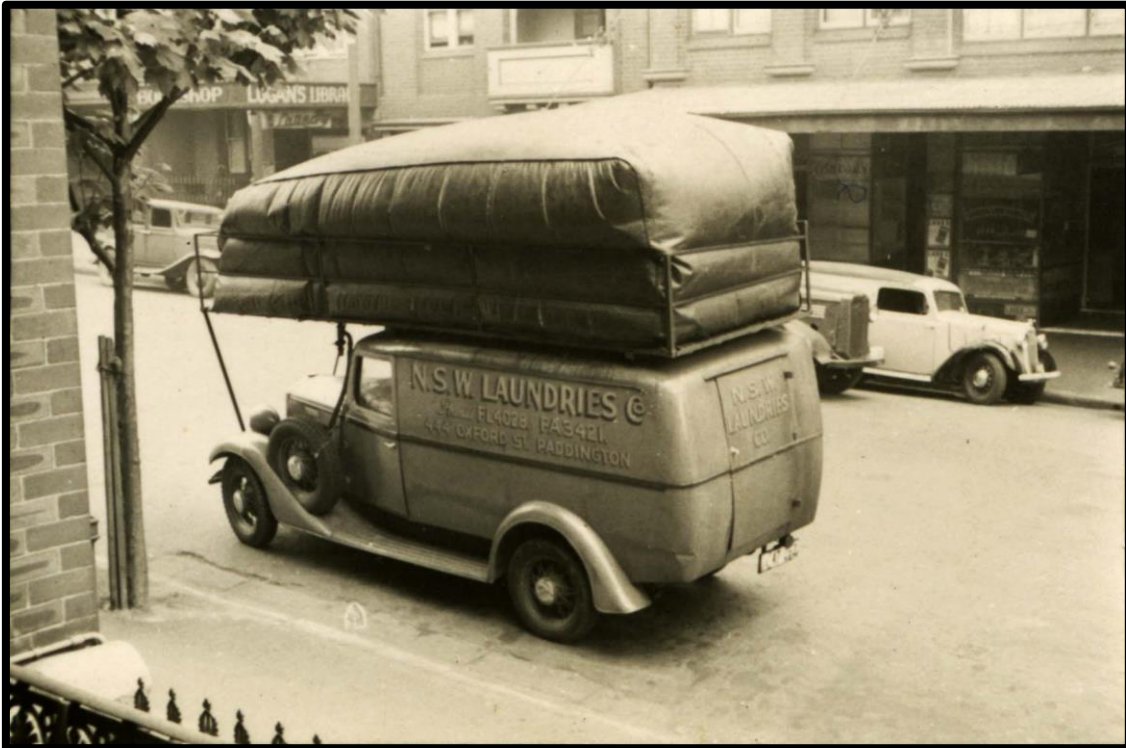
RHSQ Photo P53377

Here is another usual photo from the RHSQ digital photo collection. Do you know what it is?