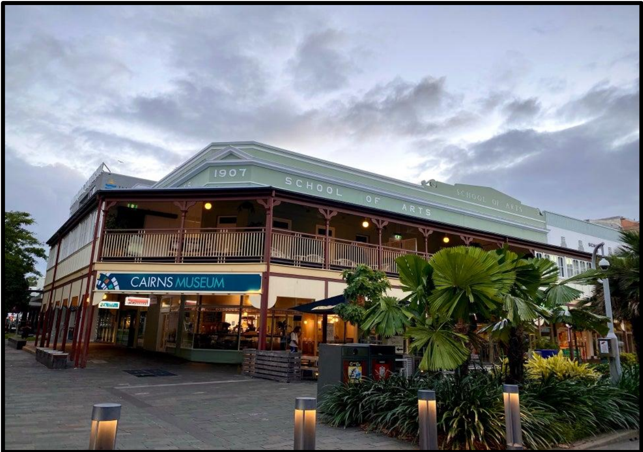
Cairns Museum Photo