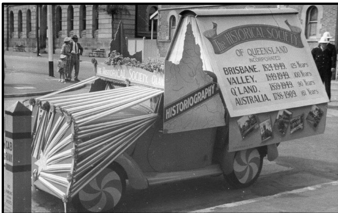
RHSQ Digital Collection P56467 Photo