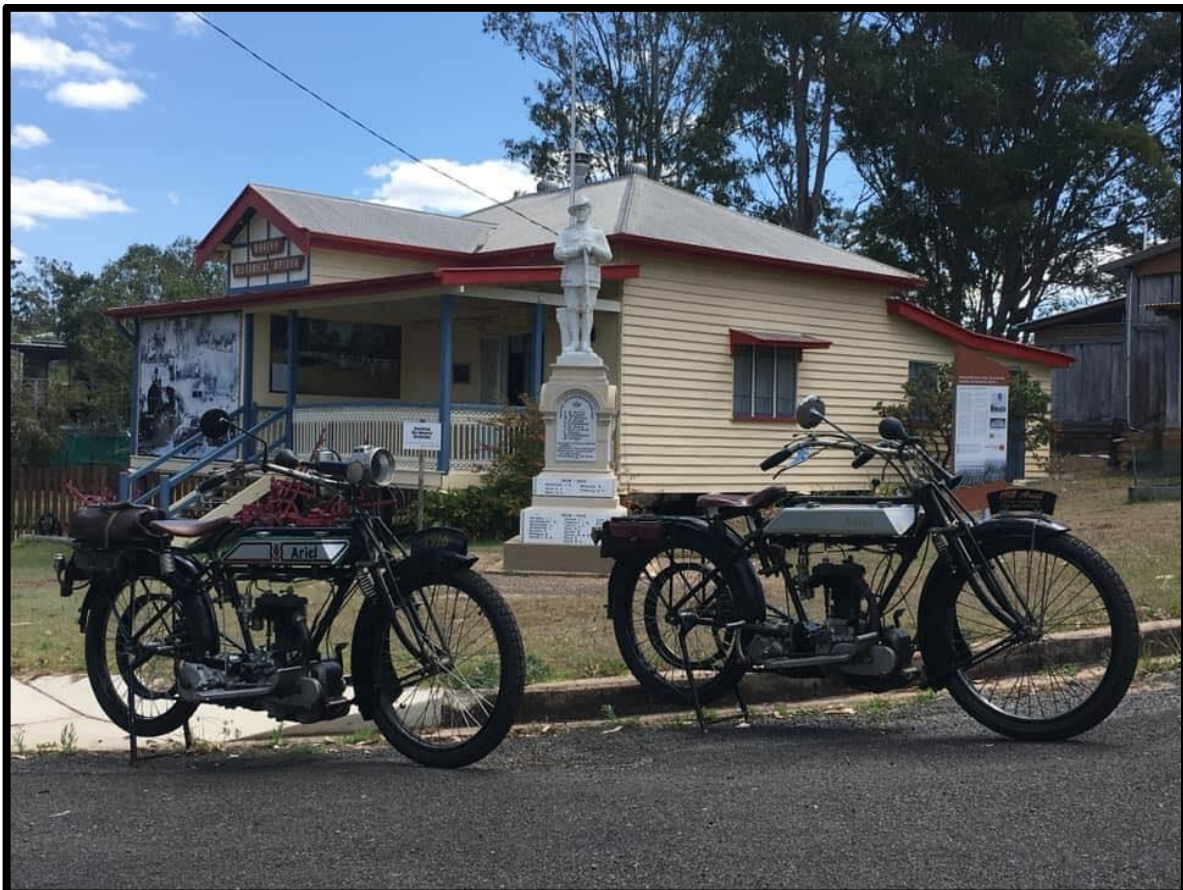
Brooweena Museum Photo

Brooweena - On 8th December 2022 a severe storm hit Brooweena and District damaging the roof of the CWA building in the museum complex. Water came into the building but luckily no exhibits were damaged.