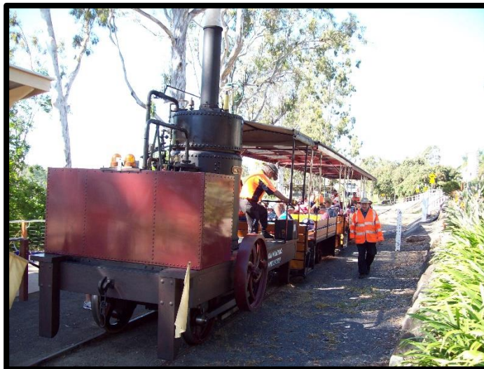
Graeme Nicholson Photo