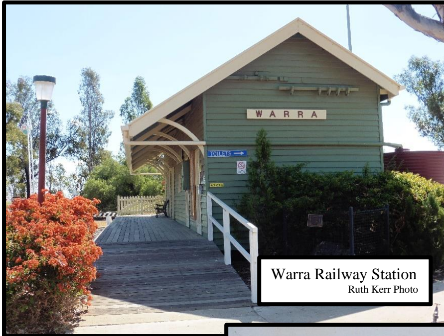
Warra Railway Station

years. An unusual feature of the railway through Warra is that there is a subway for pedestrians which was constructed in 1911-12, and is unusual on rural railways. A dam was constructed on Cooranga Creek to provide water for locomotives on opening of the railway. The largest number of passengers recorded for the station was 6580 in 1914. The heritage park adjacent to the railway and the town's hotel contains the Haystack School building, a historic baker's oven barbecue and the restored railway station.