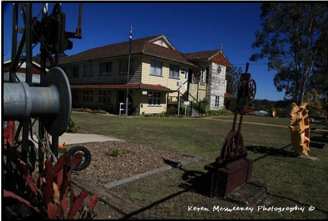
Yarraman Heritage House