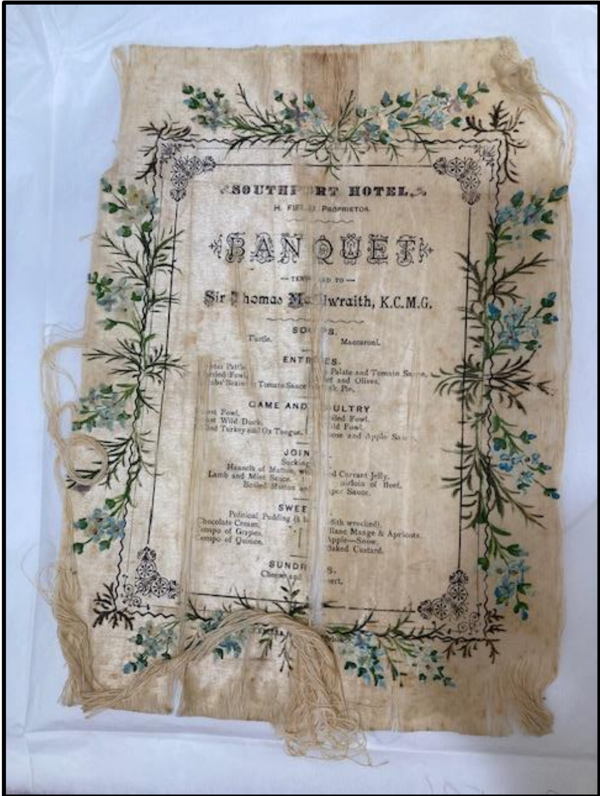
RHSQ Archives Box 506, Folder 2.