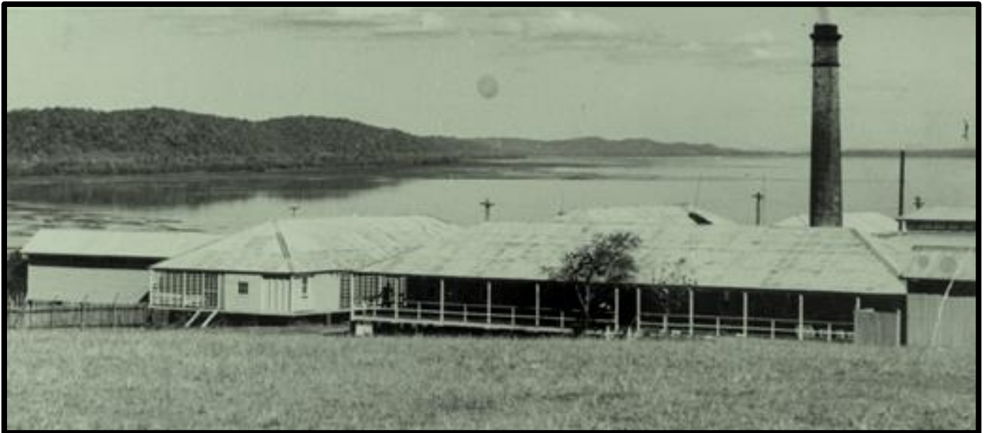
North Stradbroke Island Museum Photo