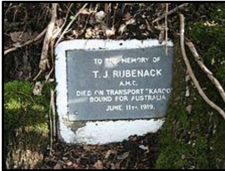
Old Heritage Photo