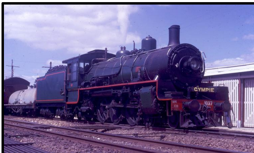
Anthony Winstone Photo

Toowoomba - DownsSteam association has announced that they are working with Mackay Heritage Railway association to transfer steam locomotives BB18 ¼ No. 1037 and No.1086 to the DownsSteam fleet. This is a significant milestone in heritage organisations working collaboratively. The initial focus will be on No. 1037, continuing the significant amount of work already completed, which will then be followed by No. 1086 as a long-term project. The Boiler of No. 1037 is already on its way to Toowoomba, with other items to follow soon. A workshop has been constructed for the purpose. ( DownsSteam Tourist Railway & Museum | Toowoomba QLD | Facebook )